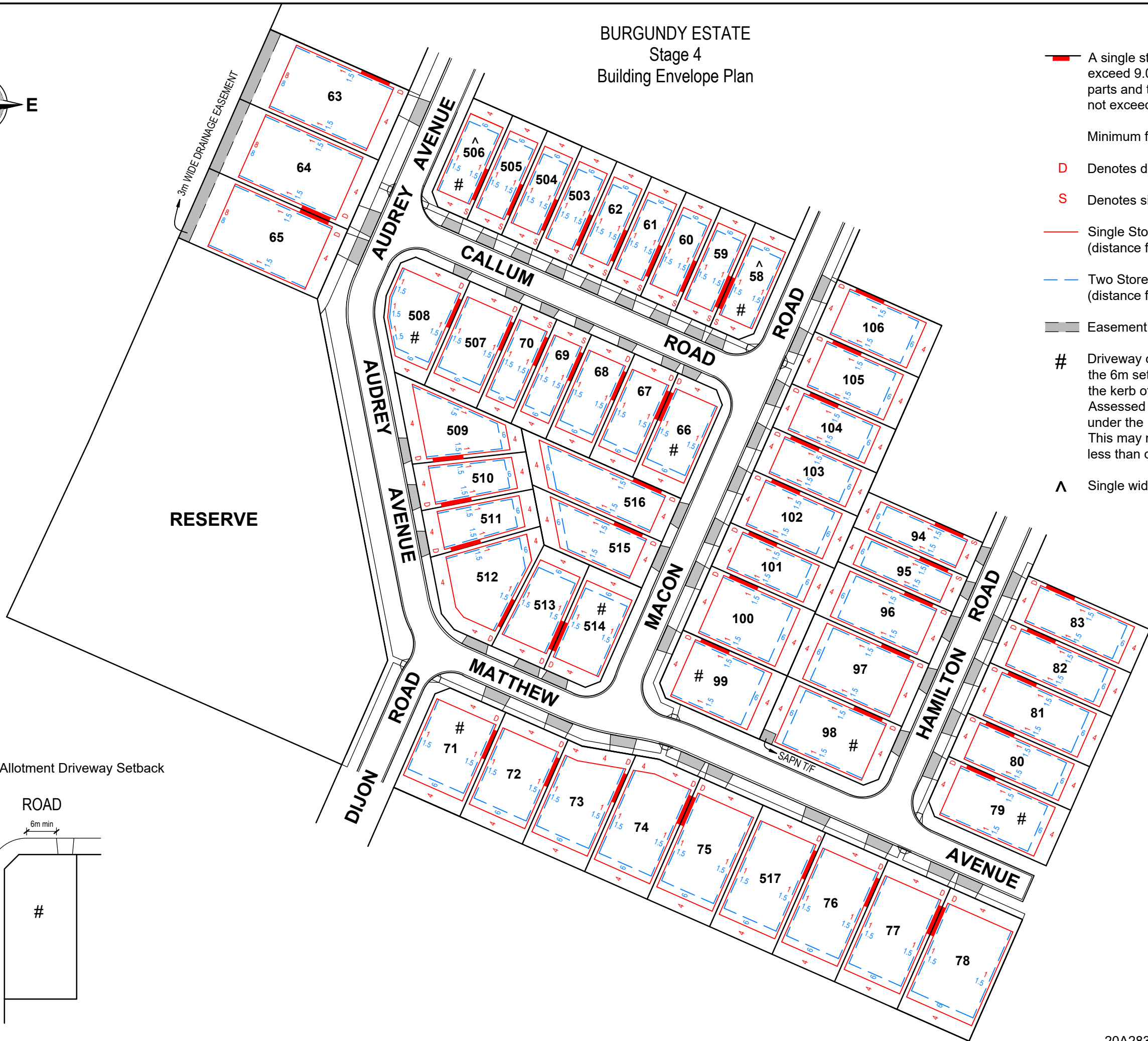
Typical Corner Allotment Driveway Setback